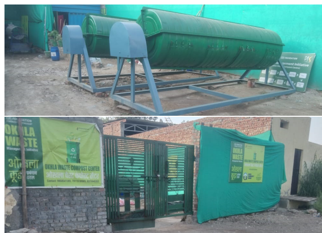
Waste to Compost Facility

The Community Compost Centre, established in January 2022 with a 500 Kg/day capacity, now has a 1200 Kg/day capacity. The Centre has treated 40,000 Kg of wet waste so far. The Composting Facility has been expanded by renting out a new one.